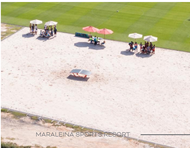
MARALEINA SPORTS RESORT